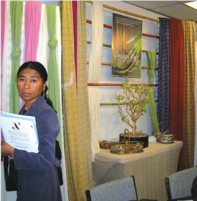
Design Knit stand featuring the latest fabric trends