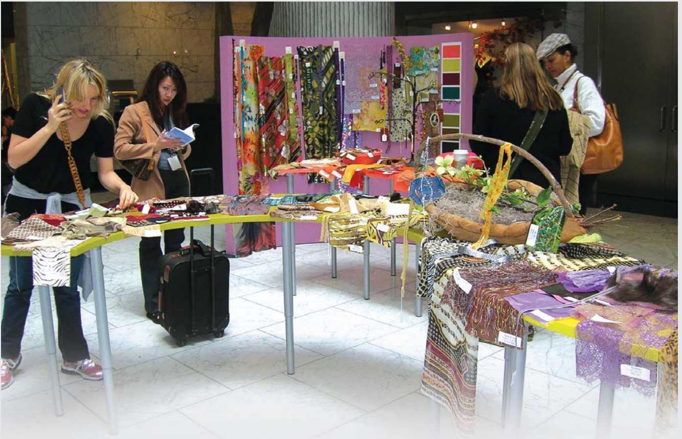
Show attendees viewing the 'Touch and Feel' trend displays and vignettes in the main lobby