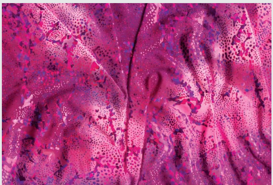
Deep purples and ripe raspberry hues feature in Pine Crest Fabrics's summer 08 collection where the emphasis is on co-ordinating foils and holograms