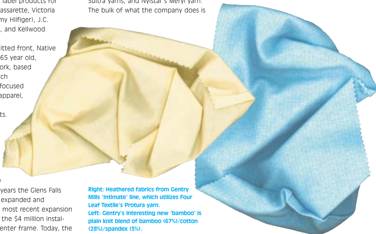
Right: Heathered fabrics from Gentry Mills 'Intimate' line, which utilizes Four Leaf Textile's Protura yarn.

The newest product that the company is producing is a product called Skins. This is a proprietary compression fabric, initially developed by an Australian company, which basically reduces the lactic acid build-up in the body, which reduces fatigue. Native Textiles is the manufacturer of this product in the United States.