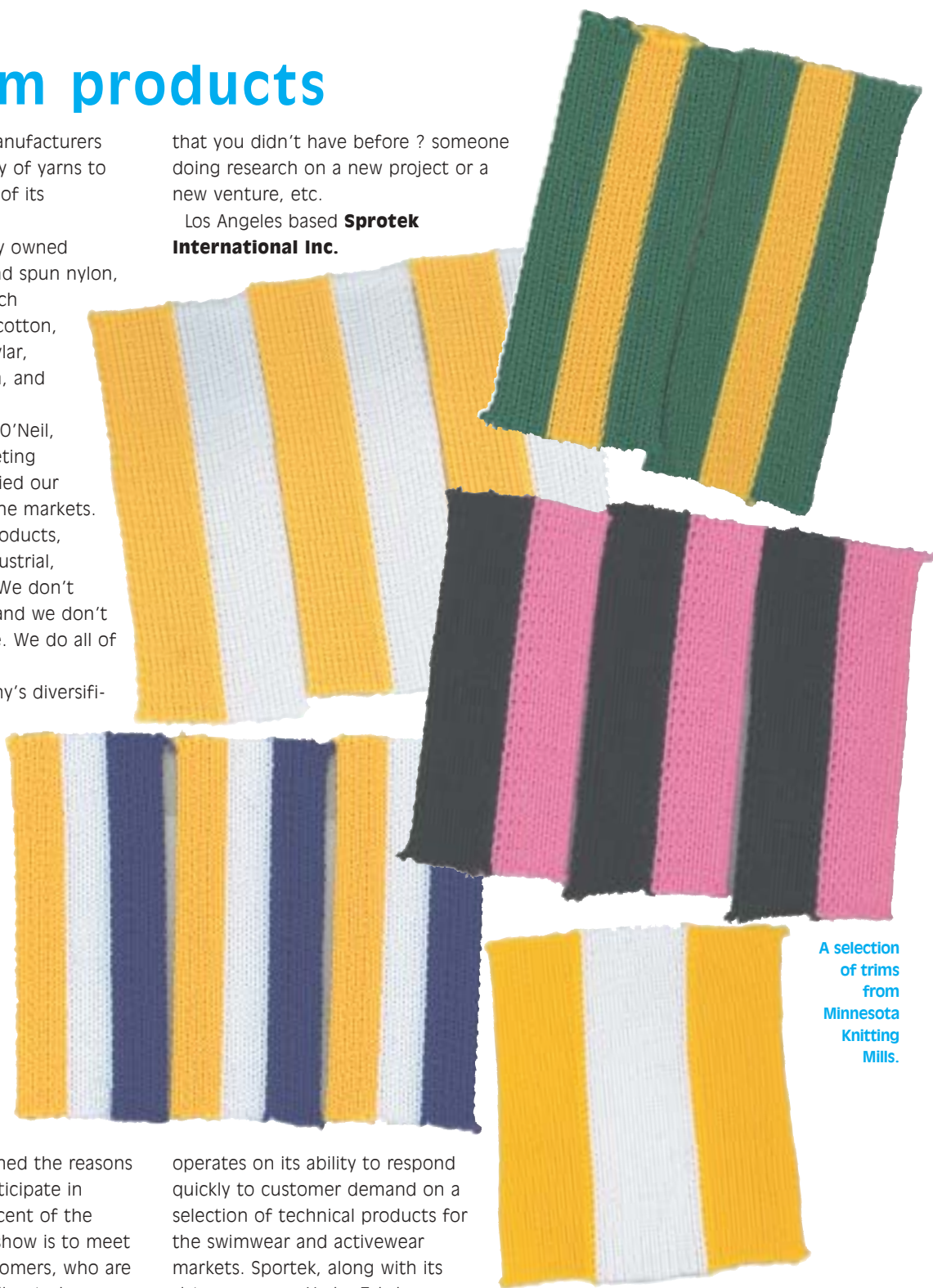
A selection of trims from Minnesota Knitting Mills.

Los Angeles based Sprotek International Inc.