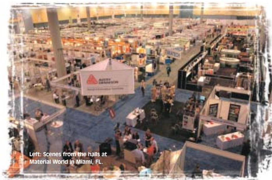
Left: Scenes from the halls at Material World in Miami, FL.

stripes. Elcatex's finished garments include basic t-shirts, fleece hoods, crews, pants, pique polo shirts, briefs, boxers, and panties.