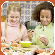
When preparing food