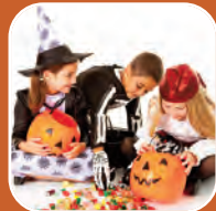
Before snack and meals