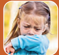
When you or someone around you is ill