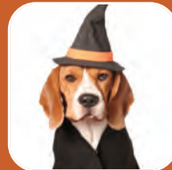
After touching animals