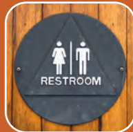
After using the restroom