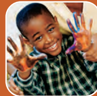
When hands are dirty